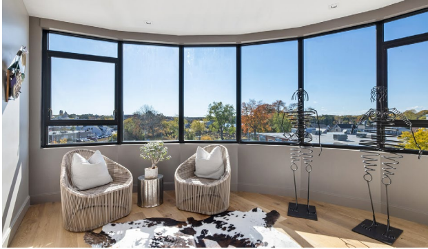
CONTEMPORARY SPLENDOR Portsmouth, NH

Municipal Approvals • Historic District Approvals Construction Documents • Construction Administration Interior Design