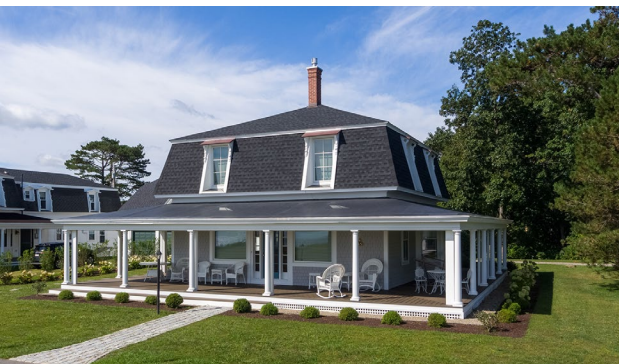
COASTAL CLASSIC Rye, NH

Municipal Approvals • Construction Documents Construction Administration • Interior Design