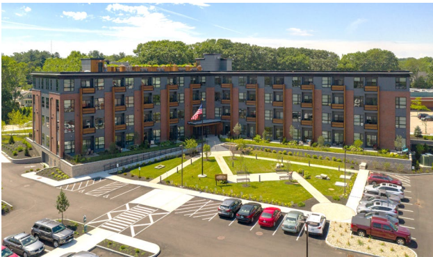
145 BREWERY LANE Portsmouth, NH

3 Commercial Units / 9 Residential Units Office/Retail Design Lower-Level Parking Garage Rooftop Deck