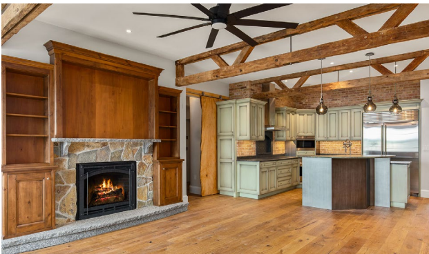
WATERFRONT OVERLOOK Portsmouth, NH

Municipal Approvals • Construction Documents Construction Administration • Interior Design