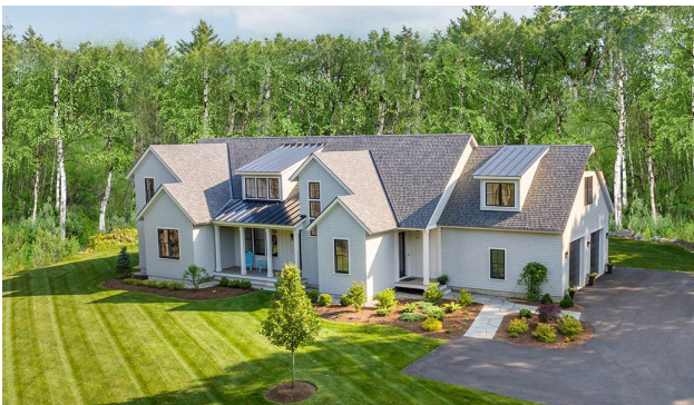
SUBURBAN HIDEAWAY North Hampton, NH

Municipal Approvals • Construction Documents Construction Administration • Interior Design