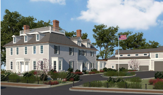
CAPTAIN'S HOUSE Portsmouth, NH

Municipal Approvals • Historic District Approvals Construction Documents • Construction Administration Interior Design