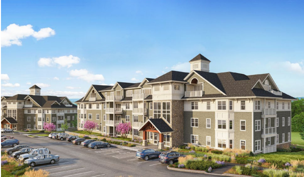
ATKINSON HEIGHTS Atkinson, NH

Municipal Approvals • Construction Documents • Construction Administration