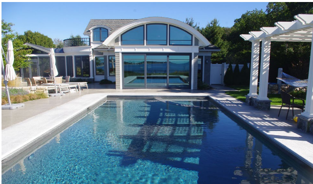
OCEANFRONT POOL HOUSE Rye, NH

Municipal Approvals • Construction Documents Construction Administration • Interior Design