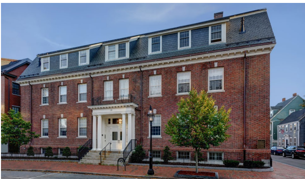
PISCATAQUA LANDING Portsmouth, NH

3 Commercial Units 4 Residential Units Lower-Level Parking Garage