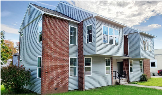
SOMERSWORTH HOUSING AUTHORITY Filion Terrace

Municipal Approvals • Construction Documents Construction Administration • Interior Design