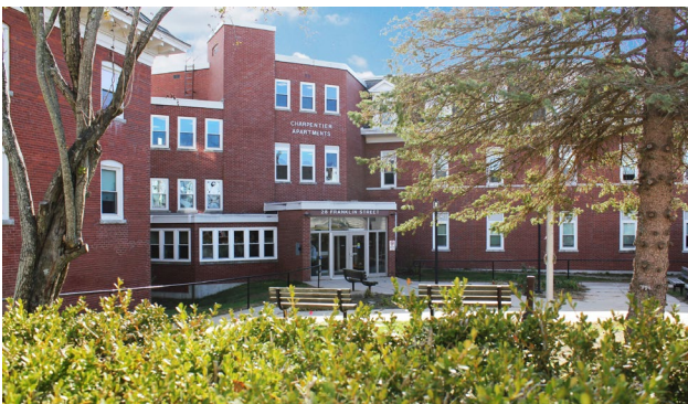
SOMERSWORTH HOUSING AUTHORITY Charpentier Apartments