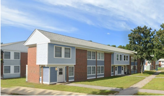
SOMERSWORTH HOUSING AUTHORITY Albert J. Nadeau Homes

Municipal Approvals • Construction Documents Construction Administration • Interior Design