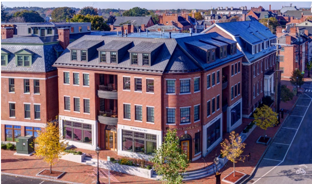
PISCATAQUA LANDING Portsmouth, NH

92 Rental Units Roof Top Deck, Amenities Balconies, Patios Lower-Level Parking Garage