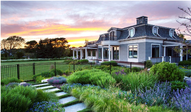
OCEANFRONT RESIDENCE Rye, NH

Municipal Approvals • Historic District Approvals Construction Documents • Construction Administration Interior Design