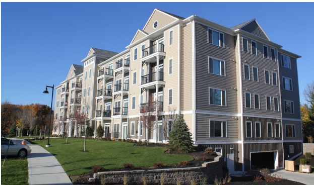
RESIDENCES AT 27 CHESTNUT Exeter, NH

288 Condominium Units Nine Mid-Rise Buildings Lower-Level Parking Garage Clubhouse Abuts Atkinson Country Club Golf Course