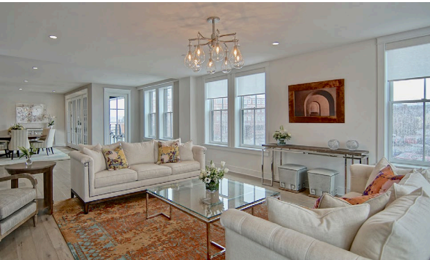
MODERN LIVING Portsmouth, NH

Municipal Approvals • Historic District Approvals Construction Documents • Construction Administration Interior Design