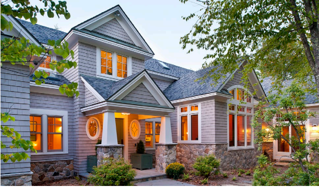
WOODLAND RETREAT Ogunquit, ME

Municipal Approvals • Construction Documents Construction Administration • Interior Design