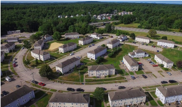
DOVER HOUSING AUTHORITY Whittier Falls

Municipal Approvals • Historic District Approvals Construction Documents • Construction Administration Interior Design