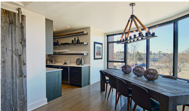
DOWNTOWN CHARM Portsmouth, NH

Municipal Approvals • Construction Documents Construction Administration • Interior Design