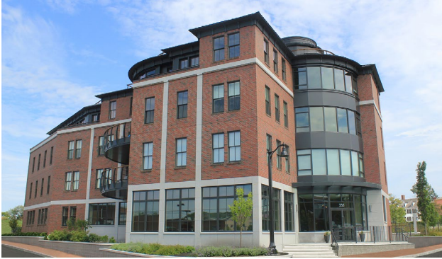
233 VAUGHAN STREET Portsmouth, NH

Municipal Approvals • Historic District Approvals • Construction Documents • Construction Administration • Commercial Interior Design