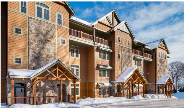
BLUEGILL LODGE AT MEREDITH BAY Laconia, NH

96 Rental Units Two Mid-Rise Buildings Lower-Level Parking Garage