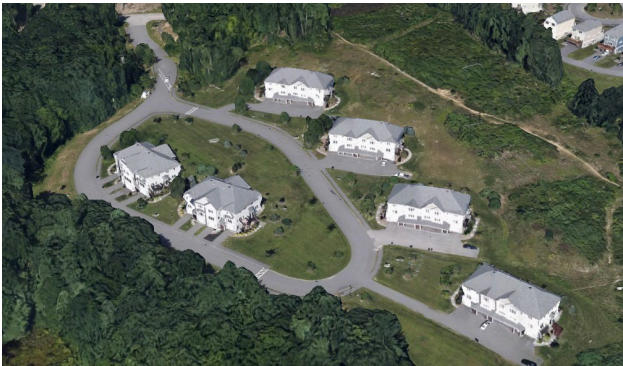
WATSON WOODS Exeter, NH

Municipal Approvals • Construction Documents Construction Administration • Interior Design