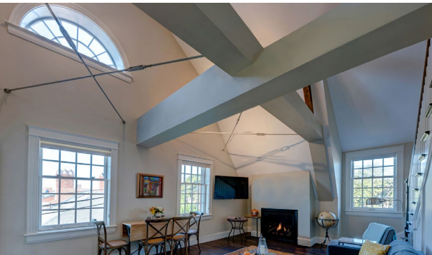
PISCATAQUA PENTHOUSE Portsmouth, NH

Municipal Approvals • Construction Documents Construction Administration • Interior Design