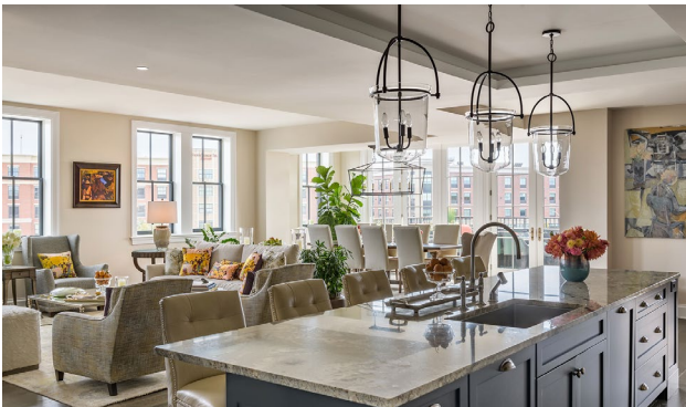
NORTH END SUITE Portsmouth, NH

Municipal Approvals • Historic District Approvals Construction Documents • Construction Administration Interior Design