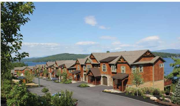
SPINDLE VIEW TOWNHOMES Laconia, NH

24 Mid-Rise Condominium Units Lakeside Community Lower-Level Parking Garage